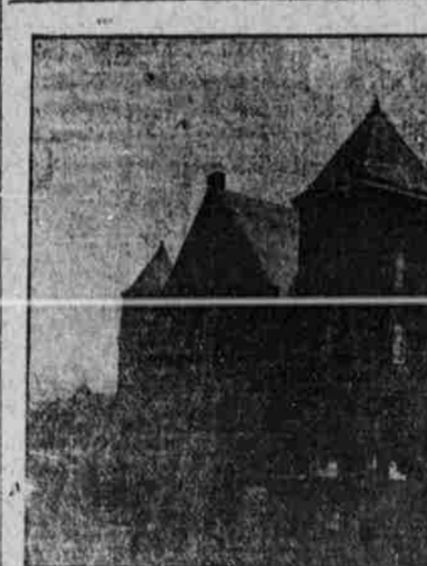
Largest Tabernacle in Oregon, where given in house of delegates tonight.