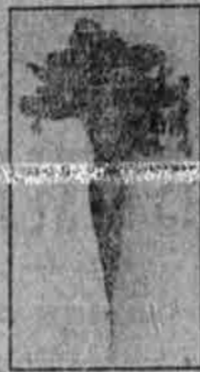
The emblem which stands as a symbol of La Grande and presides in the decorations.