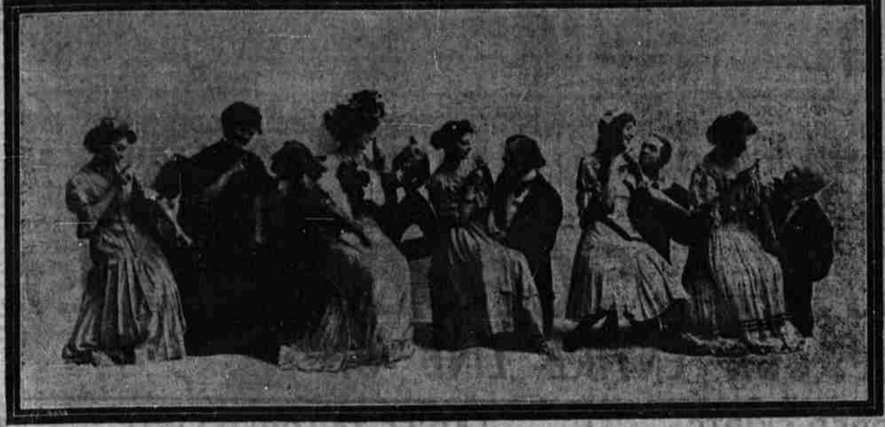
One of the Scenes in "MA'S NEW HUSBAND," at the Steward November 9.

COFFEE Five degrees of excellence: * good; ** better; *** fine; **** finer; ***** finest: all Schilling's Best. Like it: we pay him