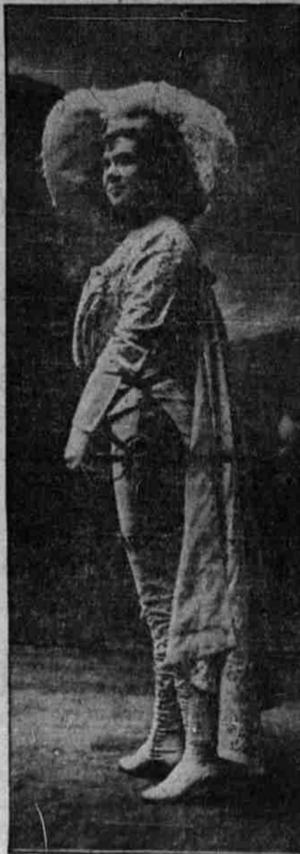
Scene in "The Cat and the Fiddle."