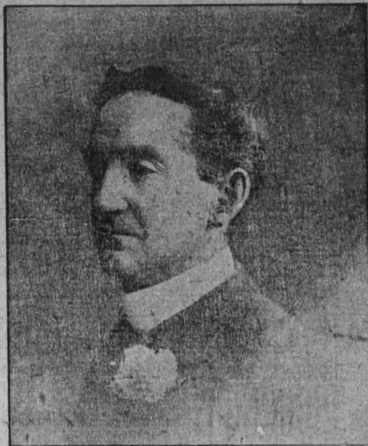
United States Senator Jonathan Bourne, Who is Now Homeward Bound.

Senator Jonathan Bourne is now on his way to Portland to participate in the presidential campaign. The senator left Washington, D. C., Monday night, and is expected to arrive in Portland next Sunday. Within 48 hours after his arrival Senator Bourne will have his part of the machinery for the Taft campaign in working order, according to a Portland paper.