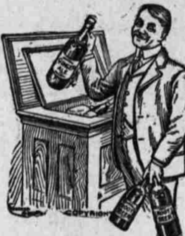
THERE'S NOT A HEADACHE,

not a single bad effect following the use of our bottle beverages. That is one reason why so many people are giving up the use of alcoholic drinks and taking, instead, our Ginger Ale, Root Beer, Sodas, Mineral Waters, etc. They taste good, are good, and have only good effects.