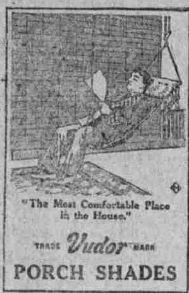
"The Most Comfortable Place in the House." TRADE Vudor MARK PORCH SHADES

Be saving. Read our ad on page 7. LA GRANDE CASH MEAT CO.