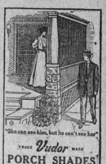
"She can see him, but he can't see her." TRADE Vudor MARK PORCH SHADES

Ask for Vudor Porch Shades, We Have Them in Four Sizes 4 ft., 6 ft., 8ft., and 10 ft., 7 ft. 8 inches high