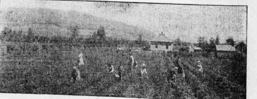
Gathering Strawberries on Grande Ronde Fruit Farms.

Laboring men will find that they can find constant employment at satisfactory wages.