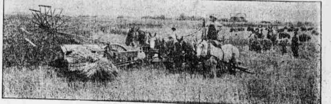
Harvesting Scene in Grande Ronde.

Union County is not confined to any one industry for support. No county in the West has such a variety of resources. Sugar, Beets Fruits, Wheat, Lumber, Hay, Dairying, Mining, Horses, Cattle, etc., etc.