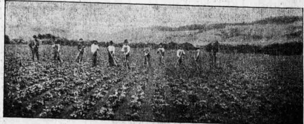
A Grande Ronde Valley Beet Field.