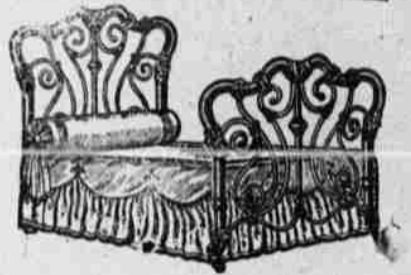
Seventeen Iron Beds.

You are cordially invited to inspect these goods.