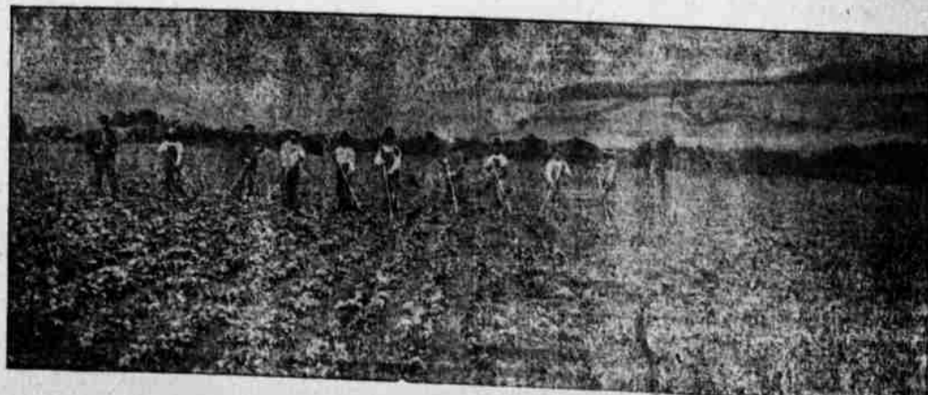
A Grande Ronde valley Beet Field.