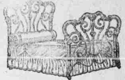
Seventeen Iron Beds.

You are cordially invited to inspect these goods.