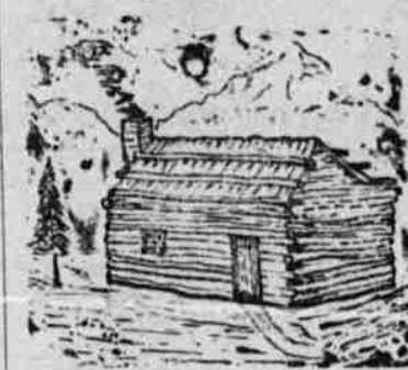
Erroneously Called the First House in the Grande Ronde Valley.

If we remember rightly, it was about the second year in the history of The Observer, that it went through the experience of all small offices, the desire to make illustrations. We sent away for a newly advertised "sure thing" process and after making the usual number of failures, finally made