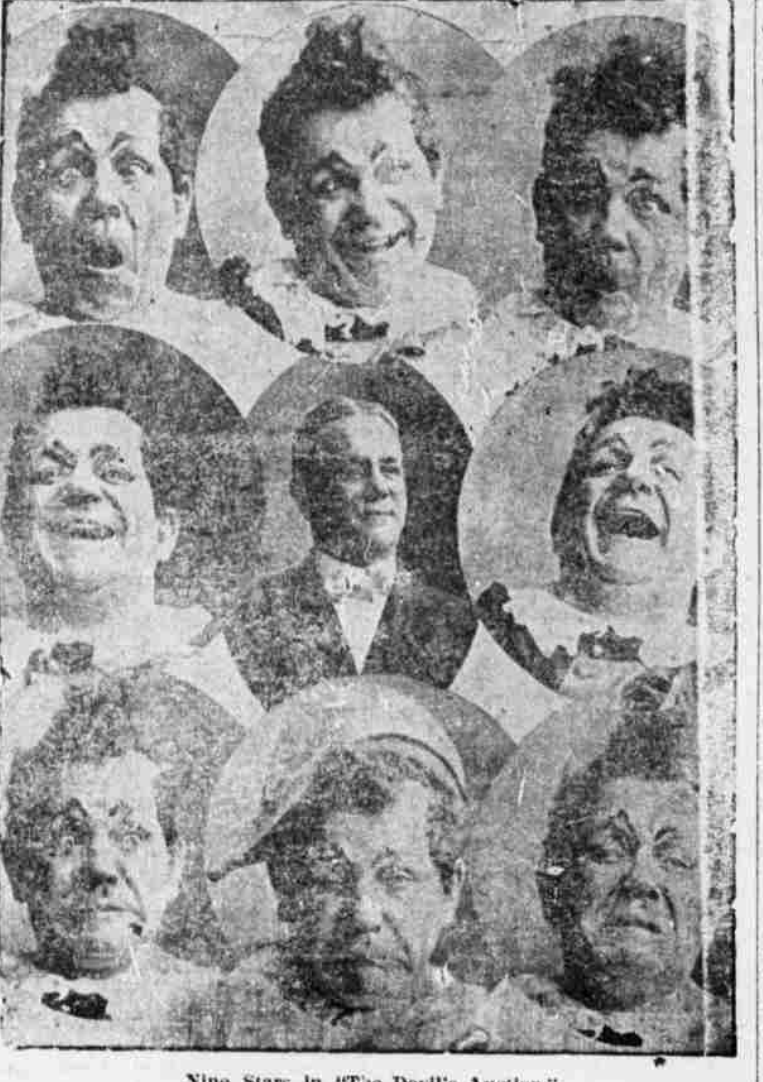
Nine Stars in "The Devil's Auction."