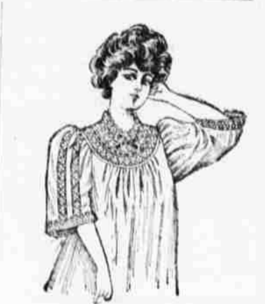
GOVNS 1.00. TO $7.50