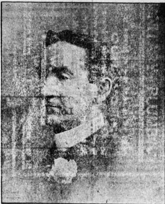
UNITED STATES SENATOR JOHNATHAN BOURNE

Since a boy Senator Smoot was op- posed to the practice and had done much to put an end to the system. As an ob- server of the Mormon people, I say to- day that they are as patriotic as any in the country. Smoot during his four years service in the senate has won the respect and admiration of his colleagues and has proven by his devotion to duty and patriotic regard for his obligations as any citizen of this republic."