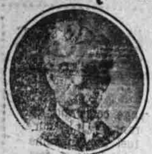
BISHOP MOORE Who will deliver his lecture in the Methodist Church next Monday evening, under the auspices of the Epworth League

REGARDING DISASS OF WOMAN In all of those maladies from which woman suffers under modern conditions of life, Osteopathic treatment is especially useful and may be fully relied upon. In no field have Osteopaths had wider experience than in this; and much of the early fame of the science was due to its unparalleled success in the treatment of these cases. The necessity of dangerous operations is obviated in very many cases—which is a great deal in itself, aside from the fact that the health of the patient is certain to be better after a natural recovery thru Osteopathy than it can possibly be after mutilation by the knife of the surgeon. Neither is there any reason for the belief that many hold that the treatment is especially embarrassing. While local treatment is often needful—in which case it would be foolish of the patient to object and culpable in the Osteopath not to administer it—yet in a very large proportion of cases it is not required; and the spinal treatment that is an essential in practically all of these cases is administered thru a garment. There is every reason for woman, in her sufferings from maladies peculiar to her spinal anatomy, to regard Osteopathy as her best friend and strongest ally.—Right Way.