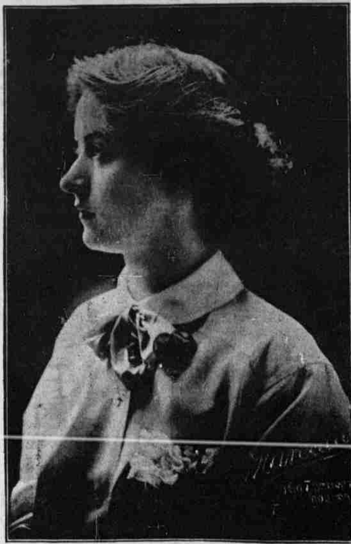
Maude Fealy in "The Elusion of Beatrice."