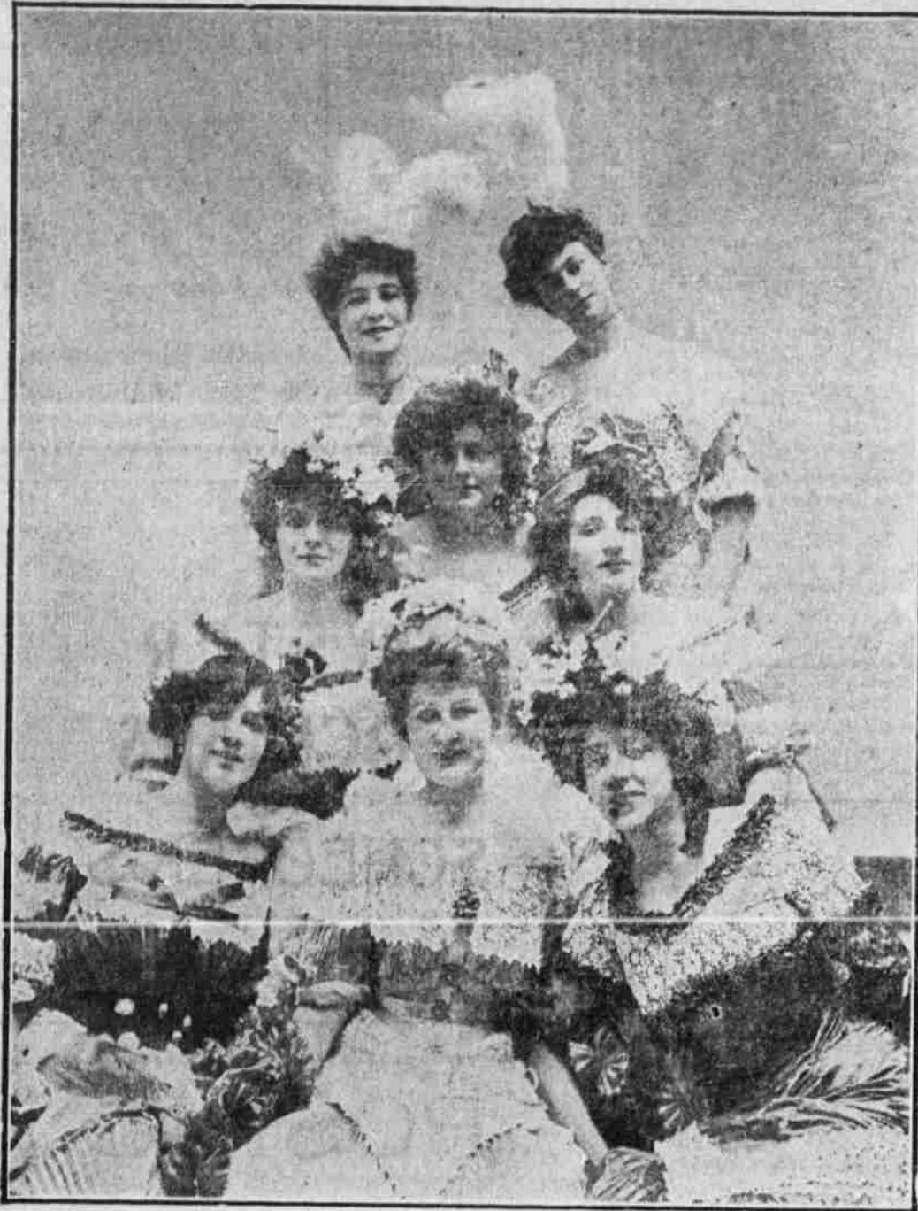
EIGHT GIRLS OF THE GREAT SINGING CHORUS—STEWART OPERA CO.