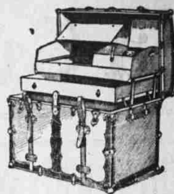
ROMADKA READY ACCESS TRUNK