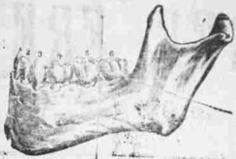
This cut represents a child's jaw