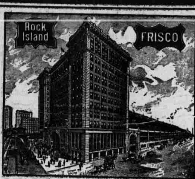
La Salle Street Station—Used by Rock Island-Frisco Lines.

(Scripps News Association) Chicago July 11—Wheat open at 77½; closed at 78½; corn opened at 52½; closed at 52½; oats opened at 35; closed 35½.