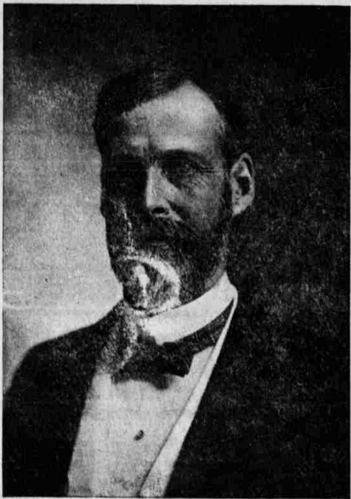
Judge Robert Eakin, Republican nominee for Supreme Judge. Judge Eakin stands for all that is best and in his hands law and justice will receive honest consideration.