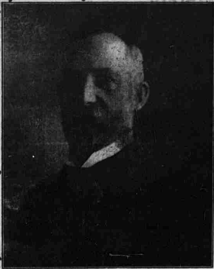
Dr. James Withycombe, the Republican Nominee for Governor has ever been a friend of the state and promises a clean business like administration