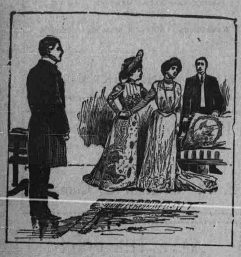
SCENE FROM THE PLUNGER