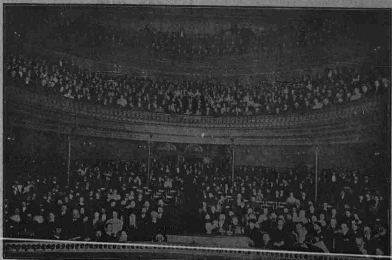
BRITISH COLUMBIA OPERA HOUSE WHERE THE MACK SWAIN THEATRE CO. BROKE ALL RECORDS AND PLAYED TO CAPACITY AND 510 STANDING CHECKS.