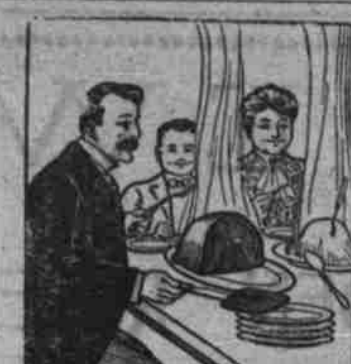
The Good Old Standby.