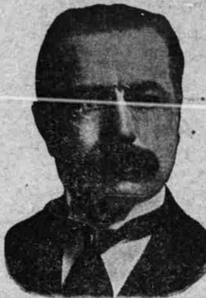
G. B. Cortelyou, Post Mast. Gen.