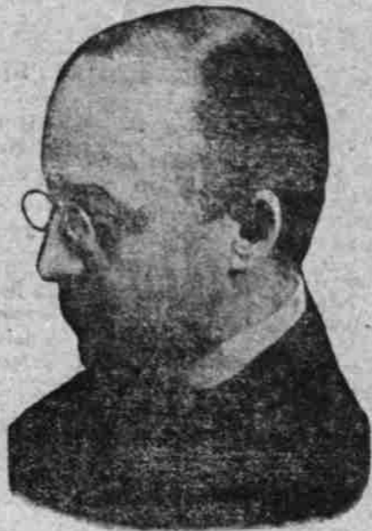
Senator Knox, of N. Y.