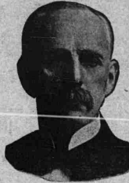
Lester M. Shaw, Sec. of Tres.

(Scripps News Association) Cleveland O, July 5—The special train bearing the Presidential party to attend the funeral of the late Secretary John Hay arrived at the Union depot at nine this morning. The President was accompanied by secretaries Shaw, Hitchcock, Wilson, Metcalf, and Bonapart, and Attorney General Moody Postmaster General Cortelyou, former Secretary of the Navy Morton, former