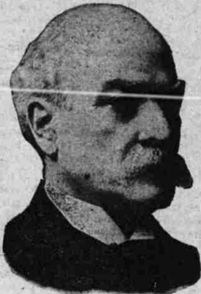
E. A. Hitchcock, Sec. Interior