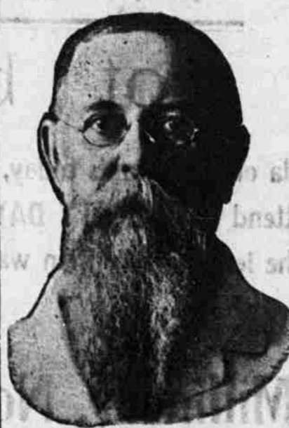
SEN. JOHN H. MITCHELL Who is now being tried in the Federal Courts.