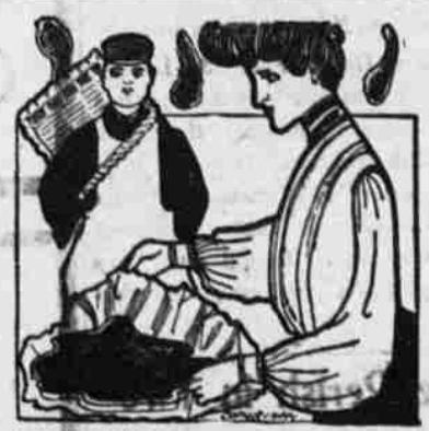
WHEN YOUR MEAT COMES

Enthusiasm begets enthusiasm. Remember this, and if you honestly believe that this is