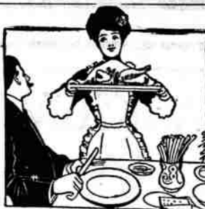
When the Turkey Comes

J Coyle, formerly a dispatcher in the O R & N offices at La Grande, is now operator at Bridge 115 near North Fork, where a steel bridge is being put in place.