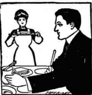
TO TAKE WELL

FOR RENT—Collar room in good in good stone cellar. Inquire at the Fair.