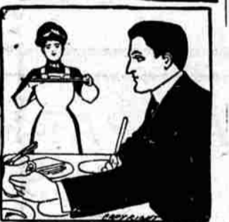
TO TAKE WELL