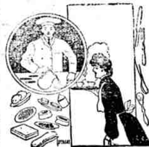
Hot Off The Griddle