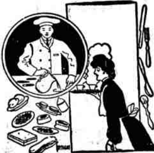
Hot Off The Griddle

Takes the grease and black off and leaves the skin soft 10 c 3 for 25 Newlin Drug Co.