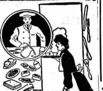
Hot Off The Griddle

GEYSERITE SOAP Takes the grease and black off and leaves the skin soft 10 c 3 for 25 Newlin Drug Co.