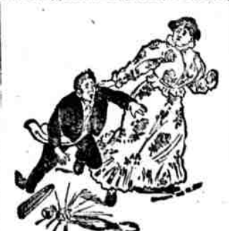
TAKE YOUR MUDDY FEET OFF THE FLOOR.