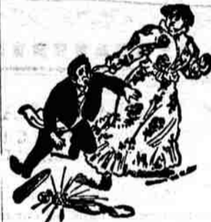
"TAKE YOUR MUDDY FEET OFF THE FLOOR"

It required the genius of Mark Twain to imagine the circumstances which combine to produce the cleverest of American farce comedies known as "A Runaway Match". Among the famous productions which he has given to the stage are "Browns in Town" and "Whose Baby are You?" but these are far excelled in both humor and plot by his latest conceit to be presented at Stewart's Opera House Friday eve Sept 30th. It will be produced by the original cast of players who are everywhere praised by the press critics for their exceptionally clever work, while the play itself is commended as being equal to the late Charles H Hoyt's famous production.