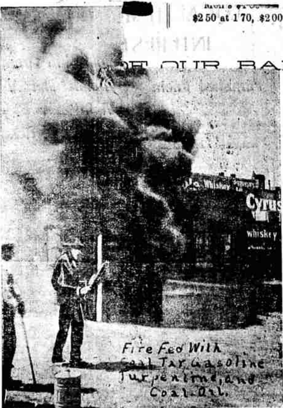
powder within five seconds the astonishment of the large crowd which of or's. He is prepared to make immediate delivery.