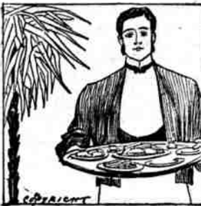
Rest Your Aunt