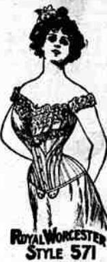
ROYAL WORCESTER STYLE 571

New straight front, dip hip, Batisse corsets for summer wear. R and W latest model, color white and drab 18-30, $1.00. We are not surgeons but we can give you a better form provided you buy one of these corsets, and you won't get the best fit in corset unless you come here. All the new shapes. $1.00 to $5.00