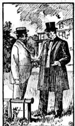
HE DEVOTED THE PHOTOGRAPHER TO COME ALONG

McKinley's Good Nature. The late President McKinley's relations with the newspaper correspondents were almost always cordial, and he never seemed half so anxious to keep them aloof as his attendants were. One of his last vacations as president was taken in the Adirondacks. Thither went a newspaper photographer on the speculation that he might possibly get some snapshots of the chief executive in his hours of ease. For two or three