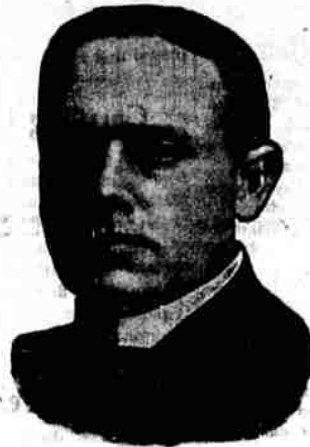
Congressman Jas. M. Dixon, of Montana.

So long as the Democratic party adheres to its "time honored principle" of "strict construction of the United States Constitution" and "state rights," the hope of the trusts and monopolists is concentrated in the success of the Democratic party.