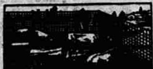
CALLED FIELD AND HOG FENCE Also Chain Link and Galvanized Fence. Best Work Poles, Lath, Posts, and Chain Link. Best Work Fence, Posts, and Chain Link. Best Work Fence, Posts, and Chain Link. Best Work