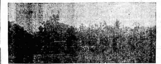
A Cove Prune Orchard

Juncudas brought fancy prices. The raspberries made a very heavy crop and although the Montana markets failed us for the first time the returns were very good. The cherry crop was only fair, yielding about 10000 boxes of the sweet varieties and for the first time in history of Cove were practically unfit for long distance shipments, in fact they were no better than the usual run in the Willamette. It is difficult to explain this except on the theory that the extreme changes of the weather just preceding the ripening season prevented the cell walls from developing to the usual conditions here thus making them subject to rapid decay, the only way they would stand shipment and go to Minneapolis or Chicago in fair condition was when shipped in refrigerators by express. Shippers will therefore either wait enough to ship car lots or be afraid to handle them except at a very greatly reduced price to what have been paid in the past. The cherry growers had a very fair season getting 4 to 6 cents per pound for the fruit in the bulk delivered to pecking place which is 25 to 50 percent more than was paid any where else on the coast for similar