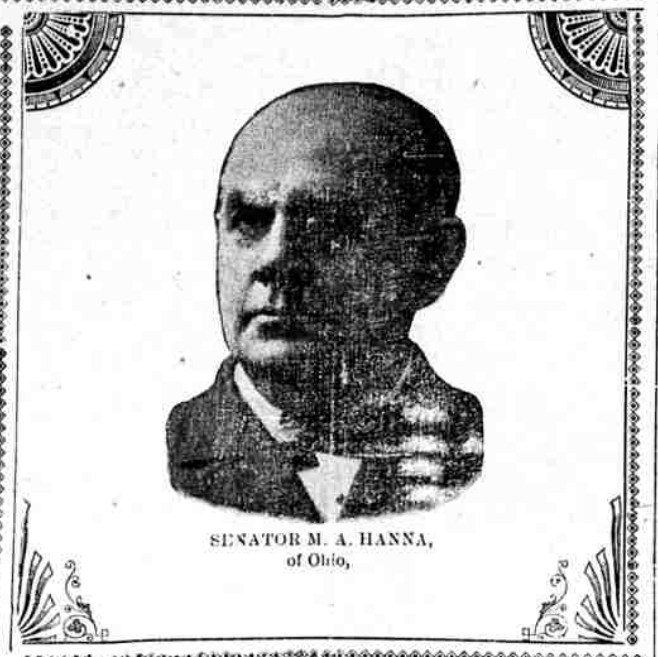
SENATOR M. A. HANNA, of Ohio.

Have just received a large line of Dress Shoes and we are selling these shoes cheaper than you can buy them in Portland. We do this to get these shoes introduced among the trade that wears good shoes.