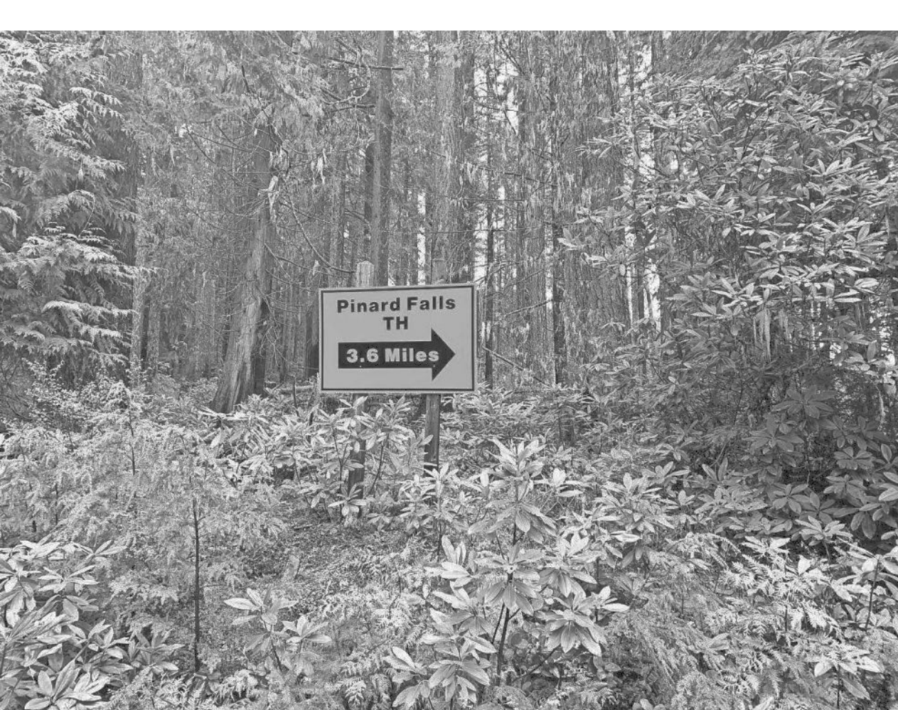
A sign points travelers to popular Pinard Falls on a network of Forest Service roads.

Memorial service will be held at 1pm, June 25, 2022, at Unger Funeral Chapel in Silverton, Oregon. In lieu of flowers please donate to Serenity Hospice.