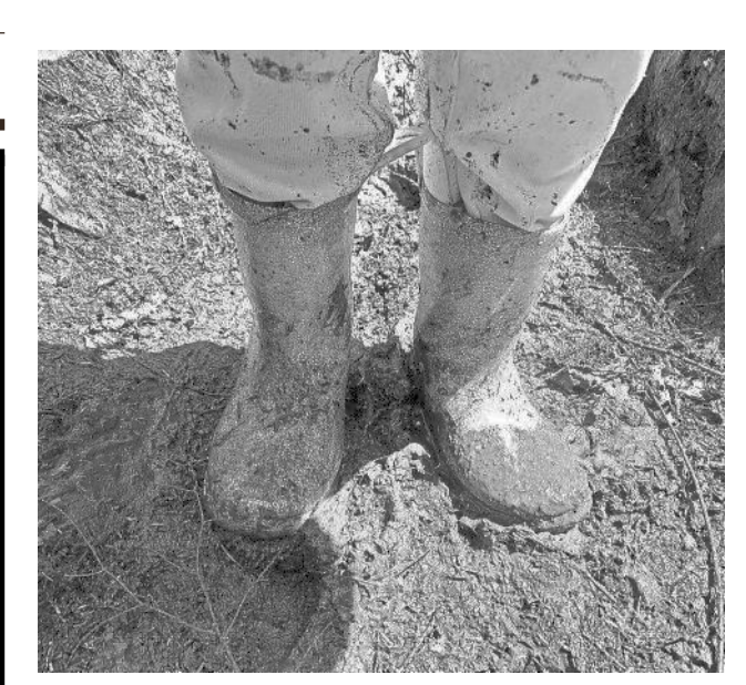
All the hiking trails to Sprit, Moon and Pinard falls get very muddy in spring.

• Affidavit Fee - $10.00 per Affidavit requested