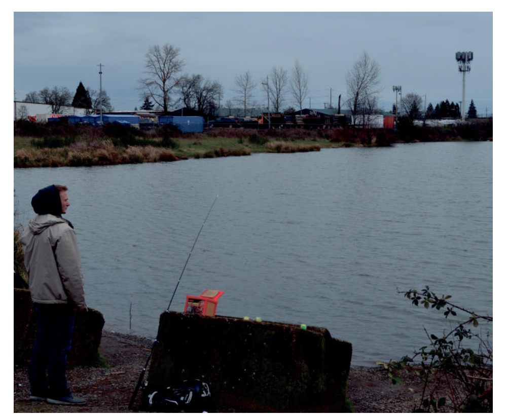
The view is urban industrial, but the fishing for trout is generally good during the trout-stocking season.