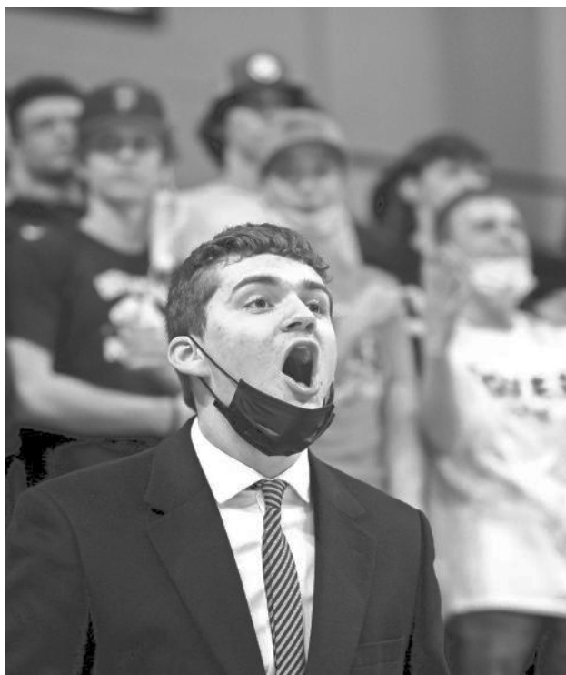
Silverton's student section reacts during the second half of the 5A semifinal game against Redmond at Gill Coliseum in Corvallis, Ore. on Friday, March 11, 2022.