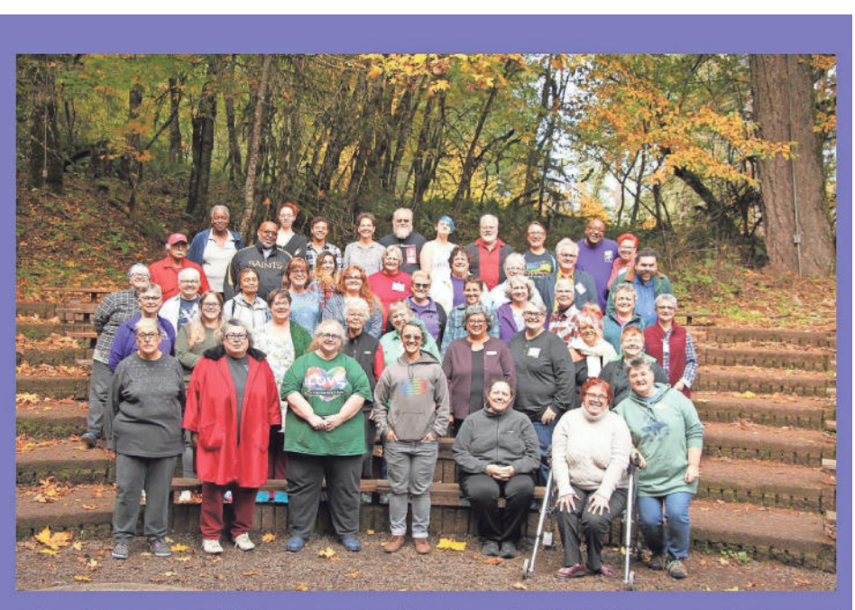
Confluence Willamette Valley LGBT Chorus Retreat October 2019

Send letters to the editor and news releases to sanews@salem.gannett.com