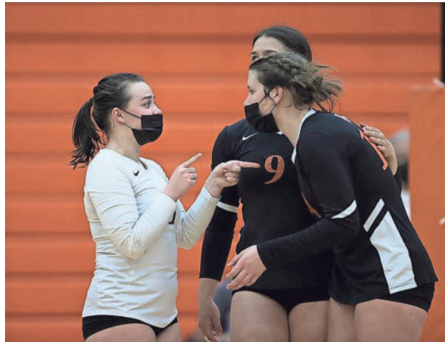
The Silvertown Foxes talk between plays against the Sprague Olympians.

After a dominant first set by Sprague, the Foxes kept it competitive, winning the second set and tight scores in the remaining sets before the Olys won 3-1.