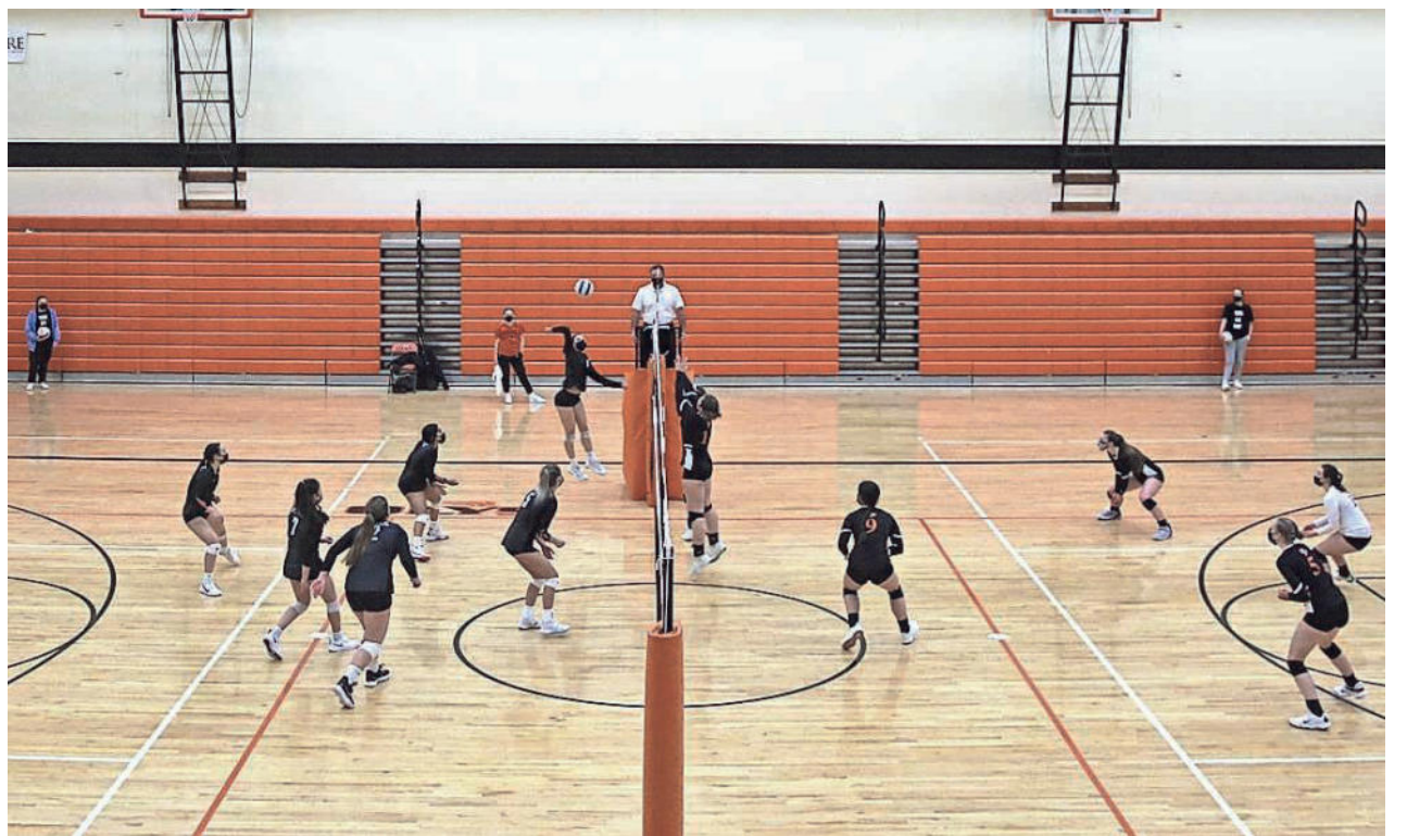
The Silvertown Foxes and the Sprague Olympians compete during the match at Sprague High School in Salem on March 24.