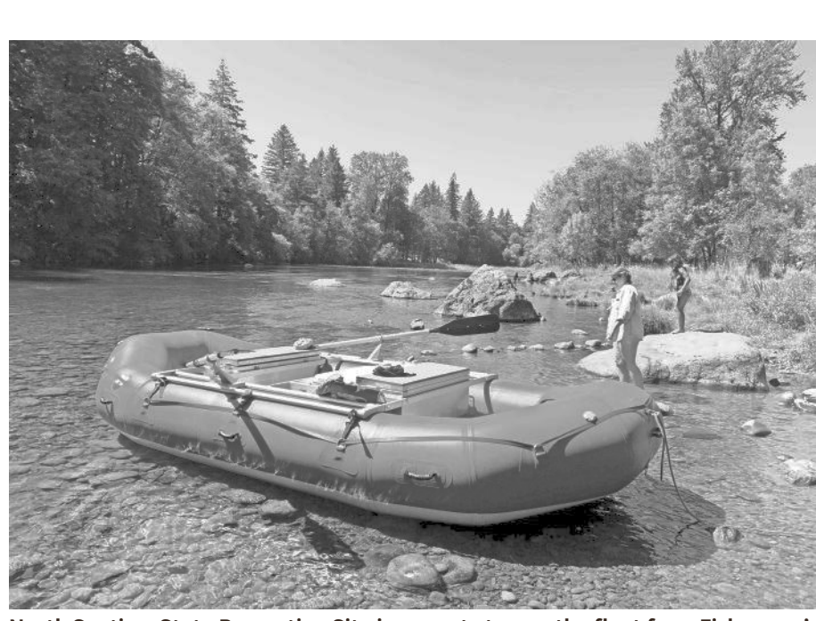
North Santiam State Recreation Site is a great stop on the float from Fishermen's Bend State Recreation Area to Mehama Bridge.

After a mellow stretch of river, and an area where you'll need to avoid rocks, you reach North Santiam State Recrea-