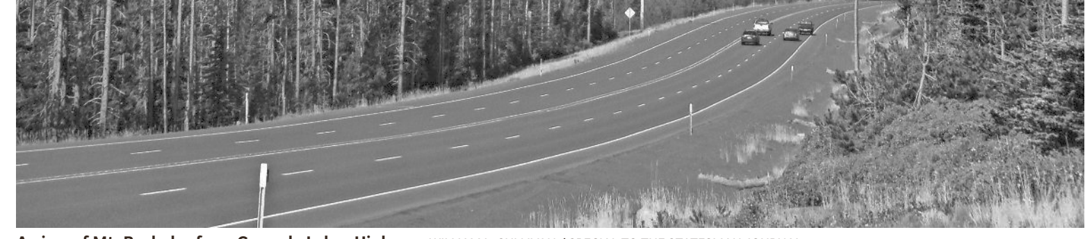
A view of Mt. Bachelor from Cascade Lakes Highway.